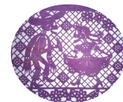
Olga Ponce Furginson