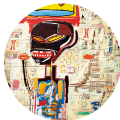
Jean Michel Basquiat